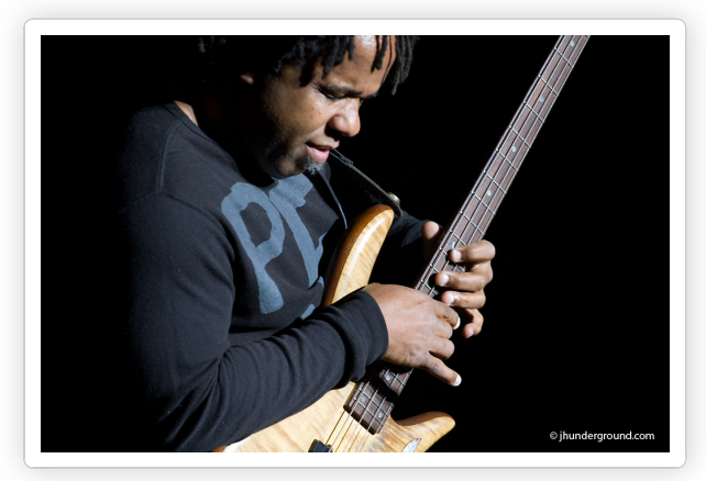
Not Pictured: Happy fingertips

Pictured: Beauty incarnate. The bald kind.